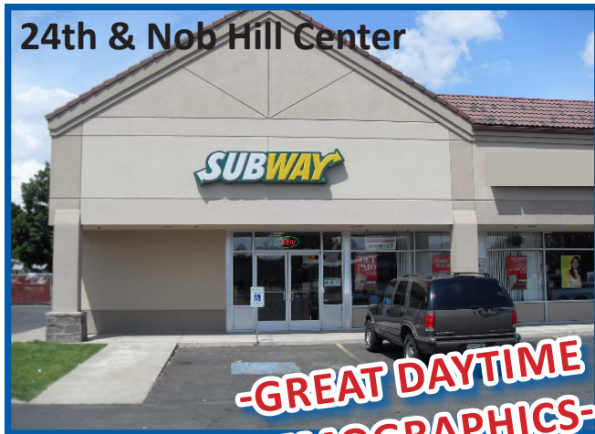
24th & Nob Hill Center

Situated at the prominent intersection of South 24th Avenue and West Nob Hill Boulevard